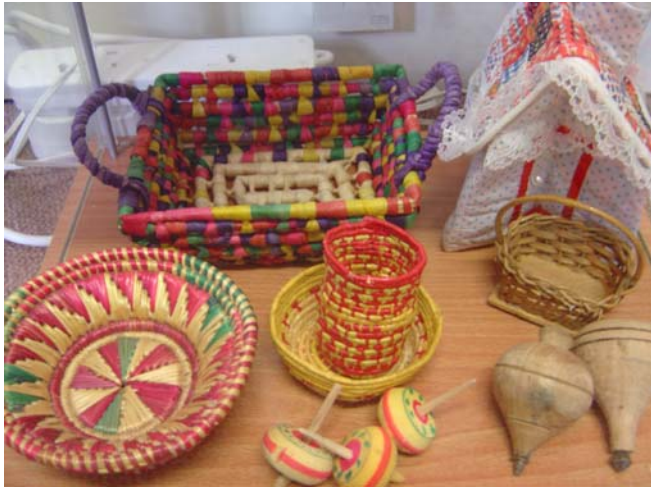
Different kinds of baskets and games