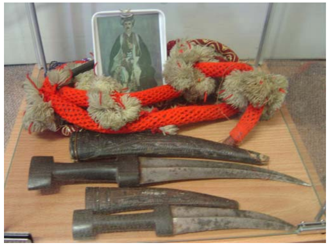
Kurdish daggers made 100 years ago