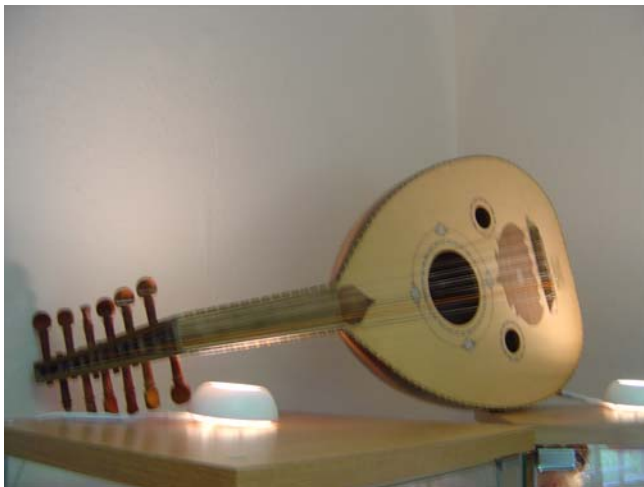
Middle-East music instrument