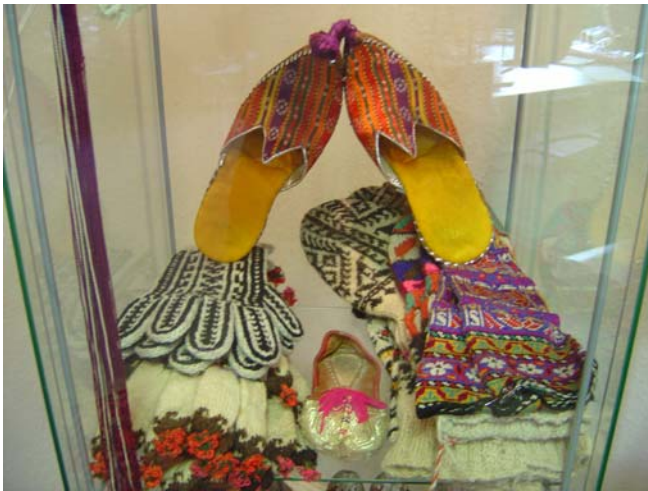
Kurdish gloves, shoes and socks