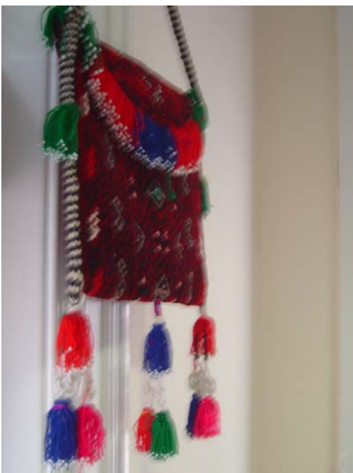
Bag, Kurdish style