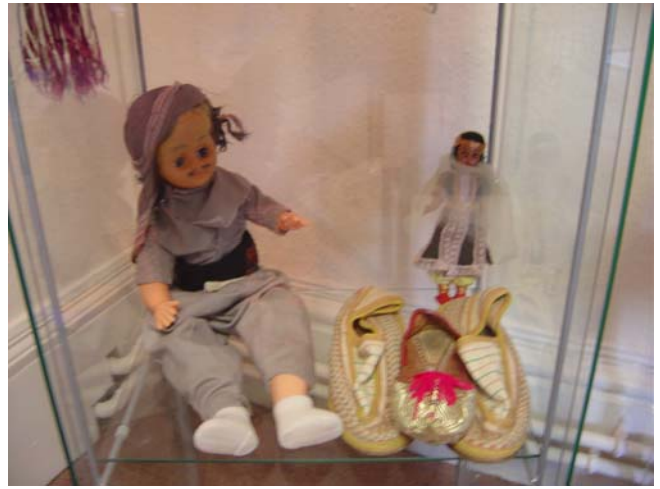
Male and Female doll's dressing clothes and shoes