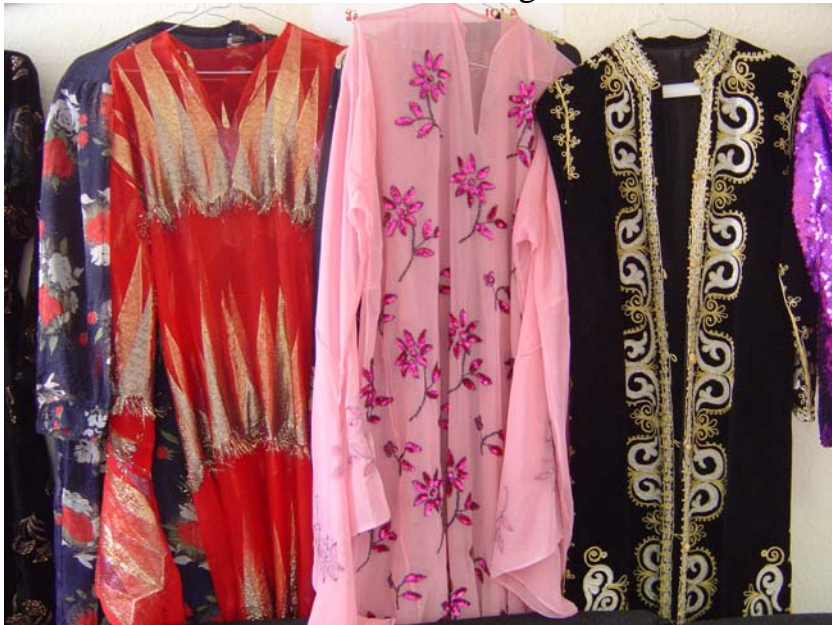
Deferent kinds of ladies' garments