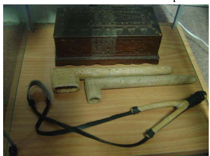
Kurdish style of nappies for babies and sling-shot