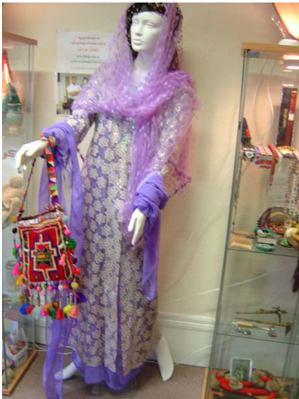
Kurdish ladies dress