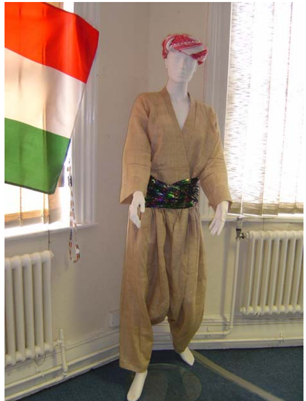
Kurdish Male costume