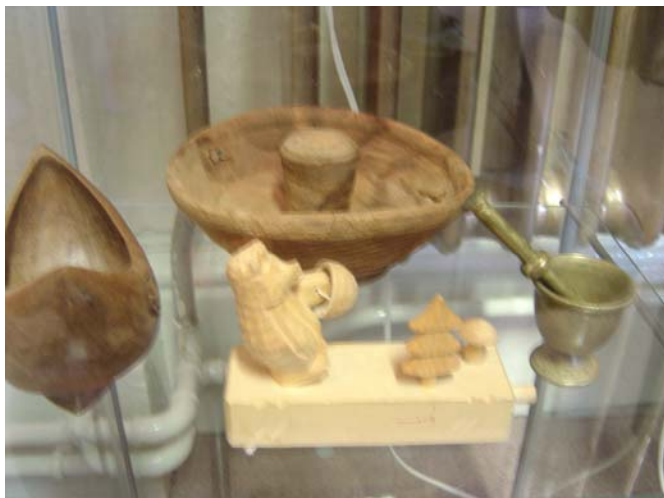
Some Kurdish kitchen items