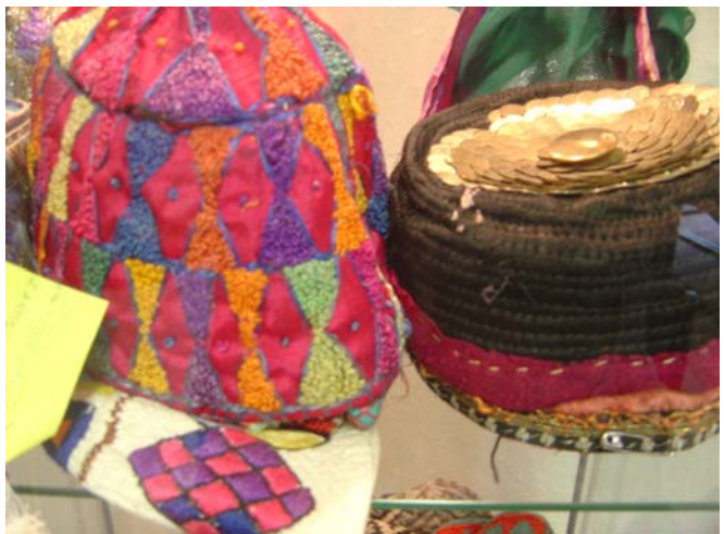
Kurdish caps for men and women