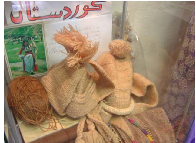
Kurdish products of wool