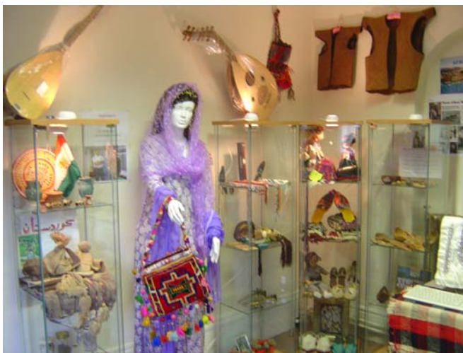
The Kurdish collections at the Kurdish Museum