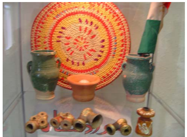
Kurdish pipes and other products