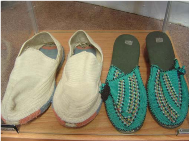
Kurdish shoes for men and women