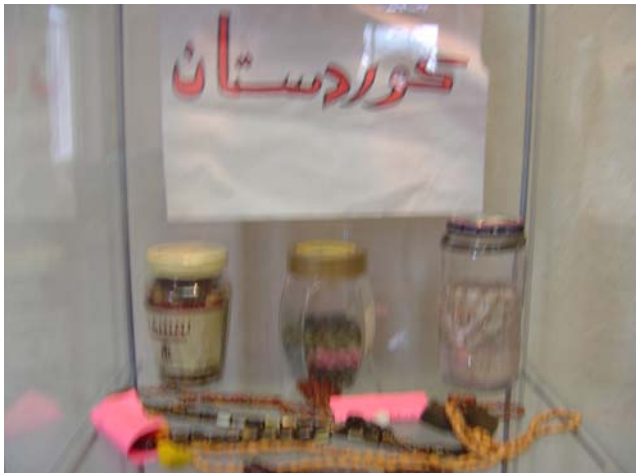
Kazwans: Green as food, hard to be beads