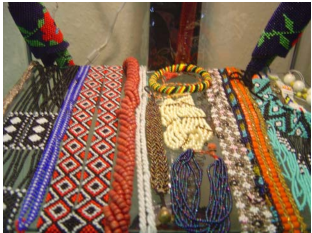
Kurdish ladies accessories