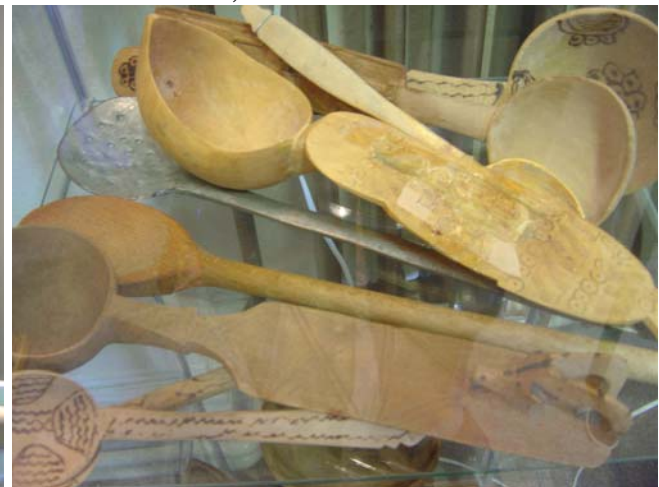
-Different wood and metal Kurdish spoons