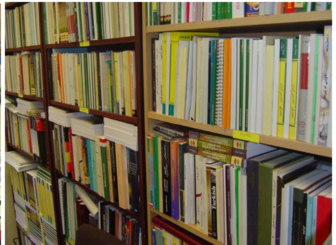
The Kurdish Library and Archive