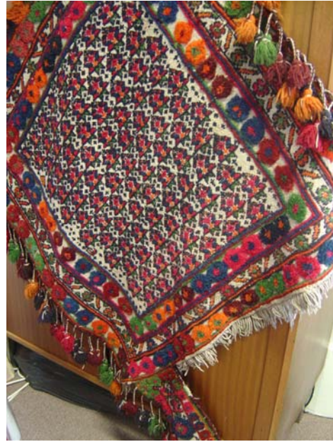
Kurdish carpets and blankets