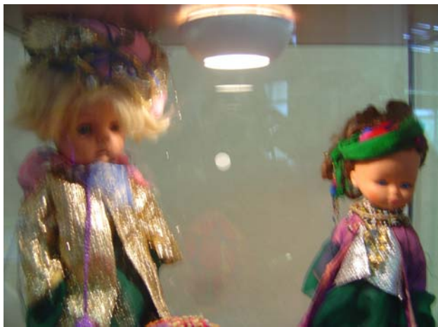
Dolls dressing: different female clothes