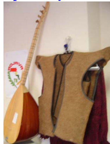
- Tanbour, Kurdish music instrument