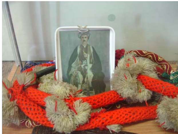
A Kurdish smoking Nargeela and Nargeela pipe