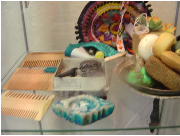
Kurdish combs, soaps and eyeliners...