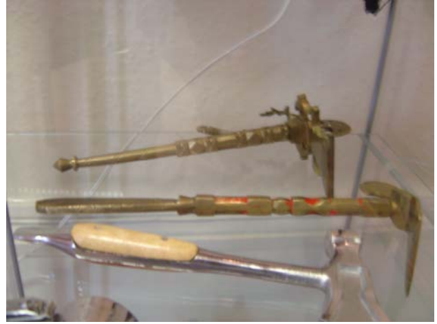
Sugar breakers for drinking tea